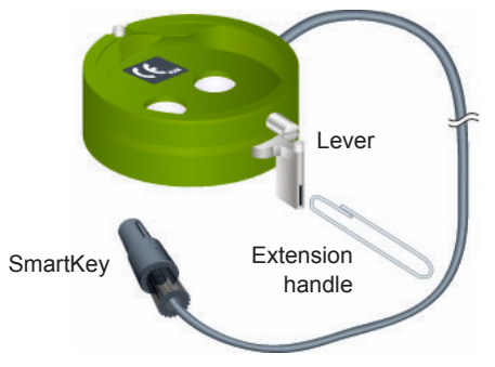
WARNING: For use with IRIDEX laser systems only.

Filter position is adjusted manually. SmartKey<sup>®</sup> provides feedback to laser to ensure no laser emission when filter is out of position.